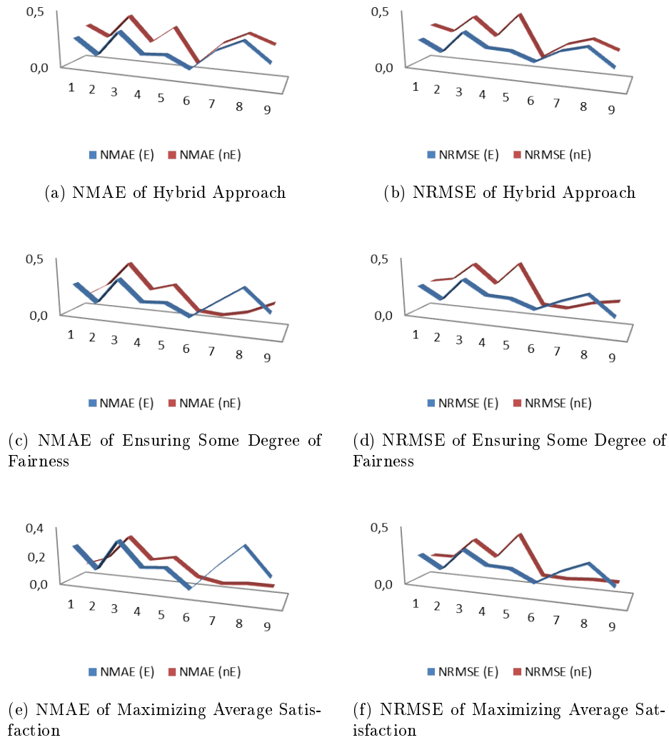
Fig. 3: Experiment 2 - Group satisfaction